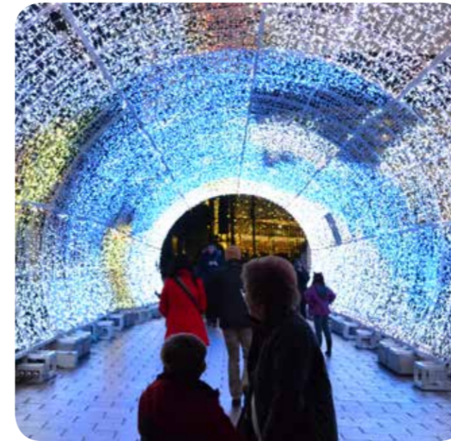
Above Tunnel of Light, a European and UK first