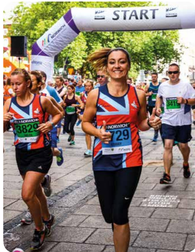
Above Run Norwich 10k race