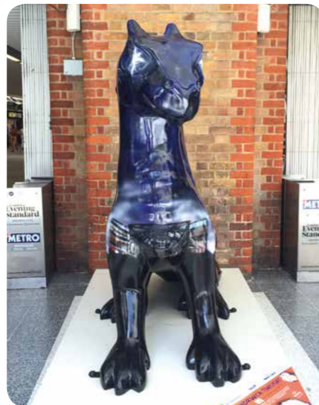
Above Twilight the BID GoGoDragon

Its integrated use of social media, fixed web and mobile technologies have increased engagement levels with people visiting the city centre.