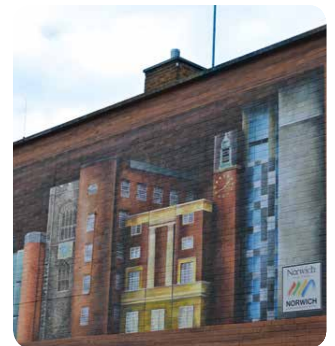
Above A couple of many BID murals around the city