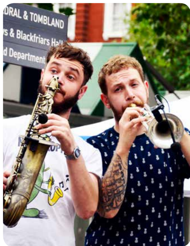
Above Head Out, Not Home entertainment

Norfolk is one of the safest counties in the UK and Norwich BID's initiatives reinforce its reputation as a welcoming, inviting and appealing destination - day and night.