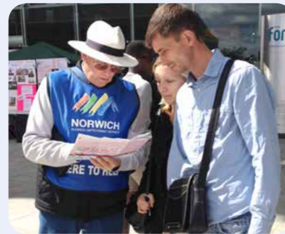
Above City Hosts Team